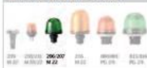
Sizes of Permanent Beacons