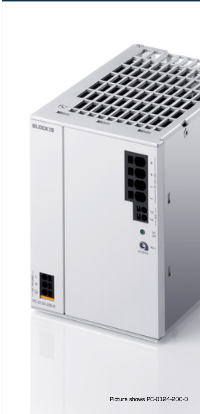
Picture shows PC-0124-200-0