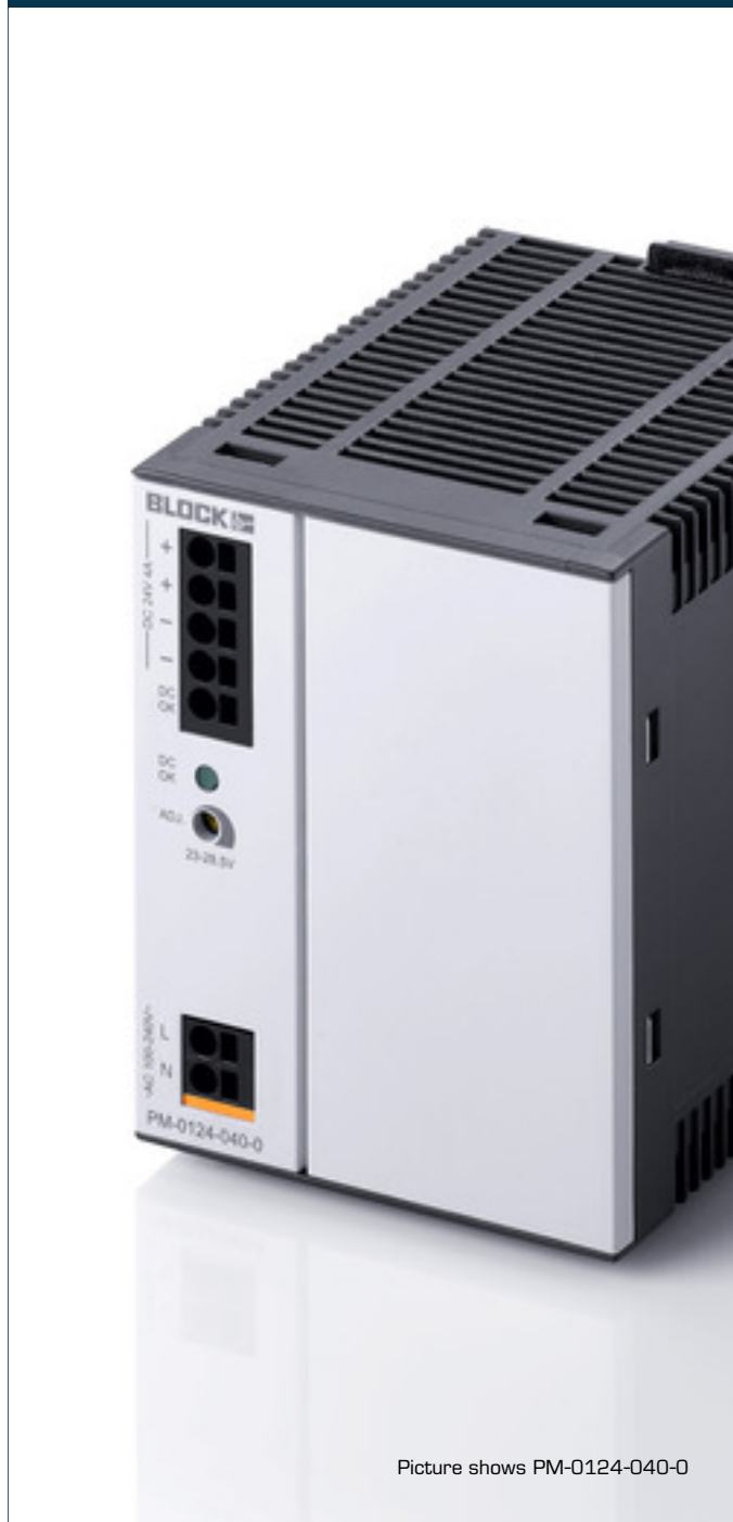
Picture shows PM-0124-040-0