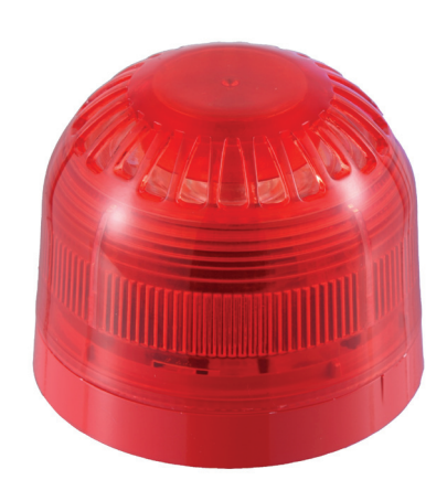
Applications - Fire; security; industrial alarm