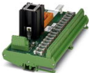
16-channel analog input module with screw connection and redundant voltage supply. Suitable for Yokogawa SAI 143 card.

Please be informed that the data shown in this PDF Document is generated from our Online Catalog. Please find the complete data in the user's documentation. Our General Terms of Use for Downloads are valid ( http://phoenixcontact.com/download )