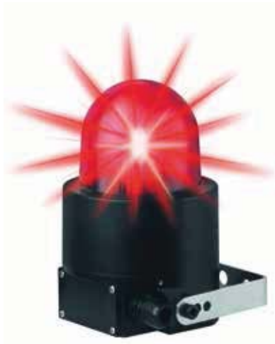
Intense double flash with low power consumption