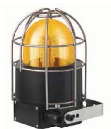
Additional protection with the robust wire guard (accessory)