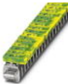
Connection terminal block, Connection method Screw connection, Load current : 41 A, Cross section: 0.5 mm 2 - 6 mm 2 , Width: 7 mm, Color: green-yellow

Connection terminal block - AKG 4 GNYE - 0421029