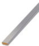
PEN conductor busbar, 3mm x 10 mm, length: 1000 mm

Neutral busbar - NLS-CU 3/10 SN 1000MM - 0402174