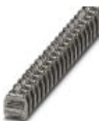
Connection terminal block, Connection method Screw connection, Load current : 41 A, Cross section: 0.5 mm 2 - 6 mm 2 , Width: 7 mm, Color: silver

Connection terminal block - AK 4 - 0404017