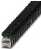
Connection terminal block, Connection method Screw connection, Load current : 41 A, Cross section: 0.5 mm 2 - 6 mm 2 , Width: 7 mm, Color: black

Connection terminal block - AKG 4 BK - 0421032