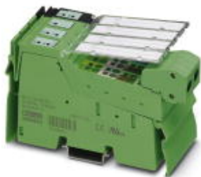
INTERBUS bus coupler, copper connection, 24 V DC, complete with accessories (connector plug and labeling field)

Please be informed that the data shown in this PDF Document is generated from our Online Catalog. Please find the complete data in the user's documentation. Our General Terms of Use for Downloads are valid ( http://download.phoenixcontact.com )