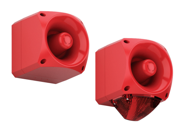
Applications - Fire alarm, Industrial alarm, Process control alarm